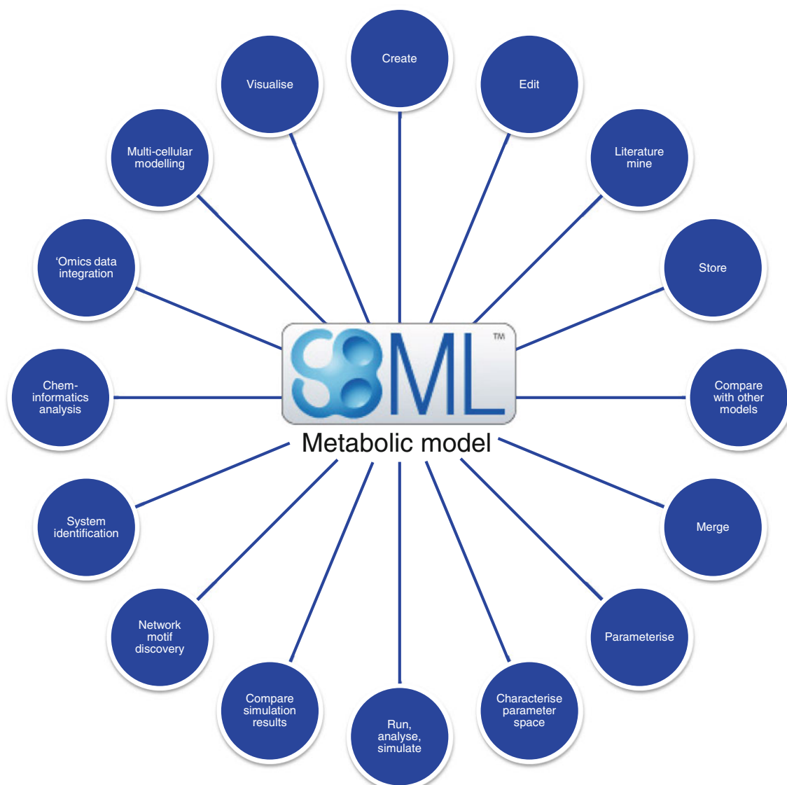
Fig. 1 A summary of some of the intellectual areas in which we can create and exploit the contents of systems biology models as encoded in SBML

detailed metabolic reconstruction of CHO. Additionally, one may anticipate the importance of predictions of metabolic fluxes in understanding nutrition and regulation in health and disease.